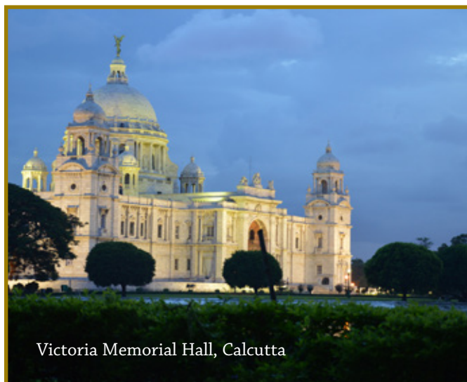
Victoria Memorial Hall, Calcutta