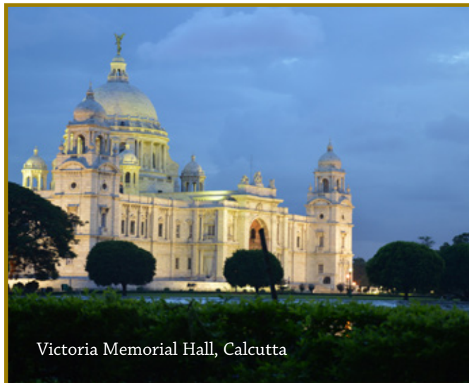
Victoria Memorial Hall, Calcutta