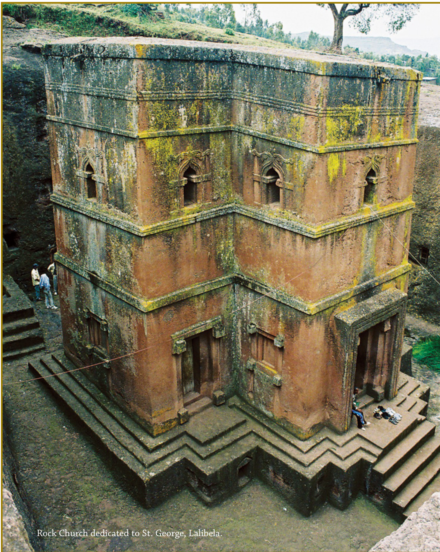
Rock Church dedicated to St. George, Lalibela.