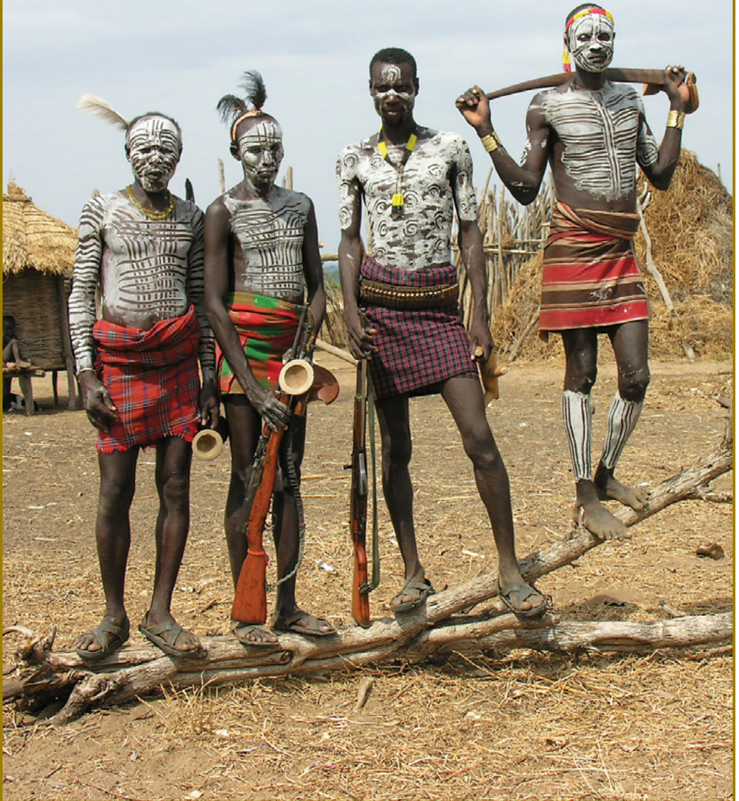
Karo tribe village.