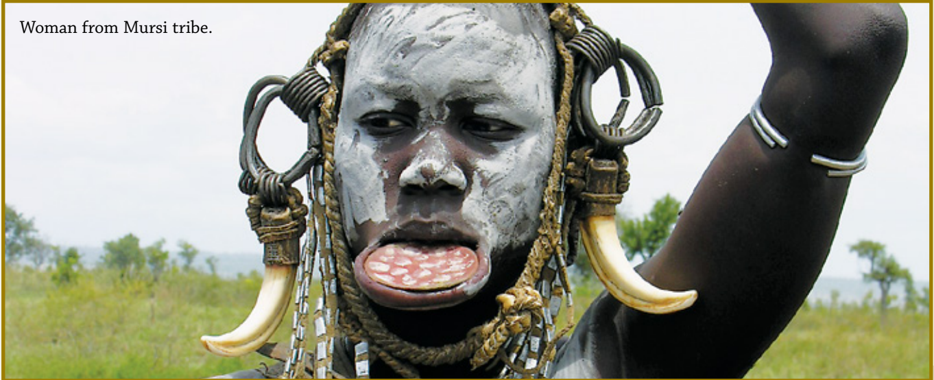
Woman from Mursi tribe.