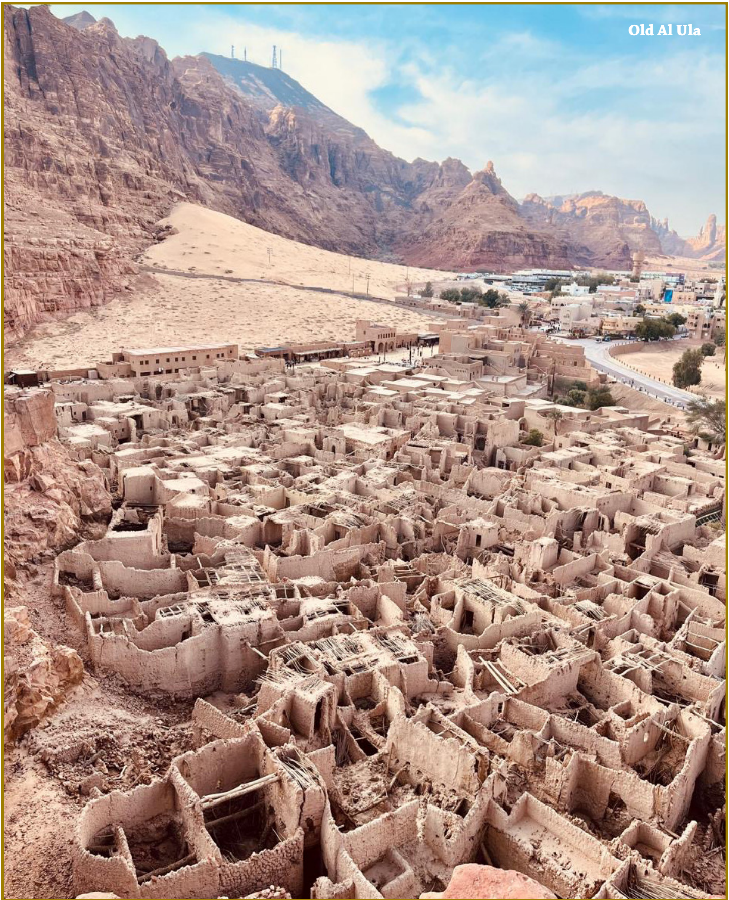
Old Al Ula