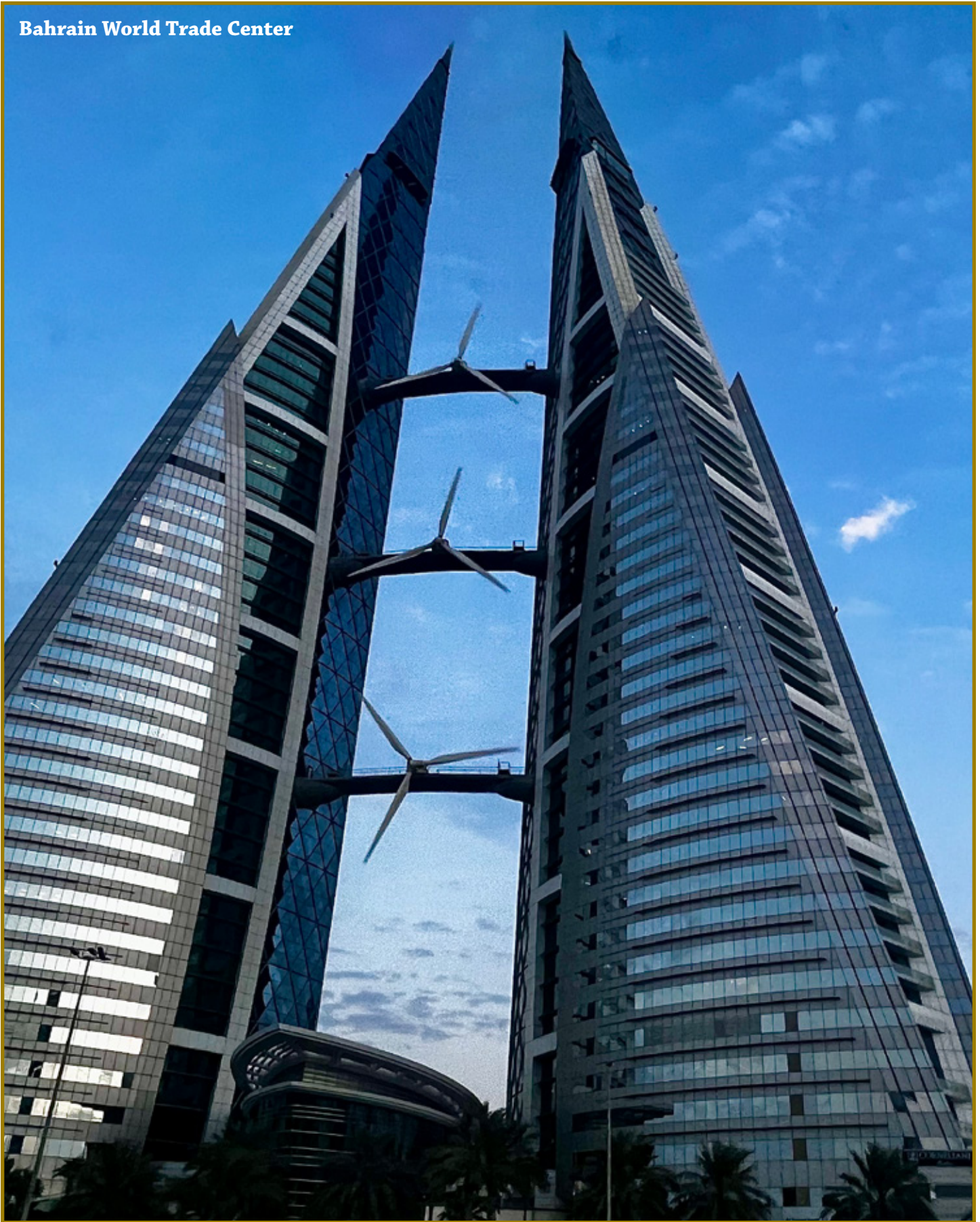
Bahrain World Trade Center