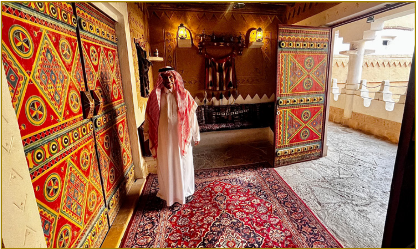
Al Tayebat International City Museum