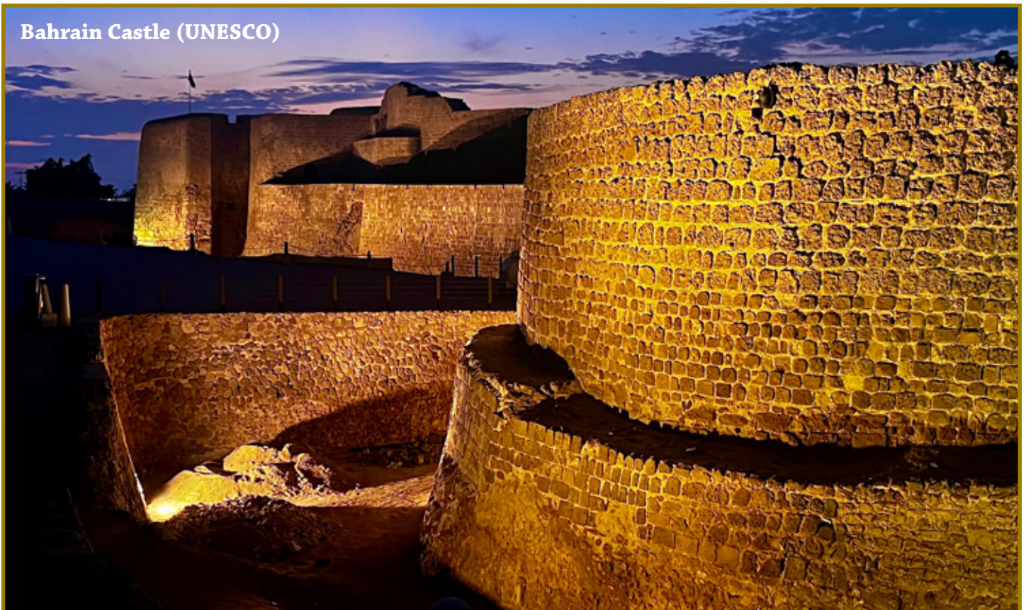
Bahrain Castle (UNESCO)