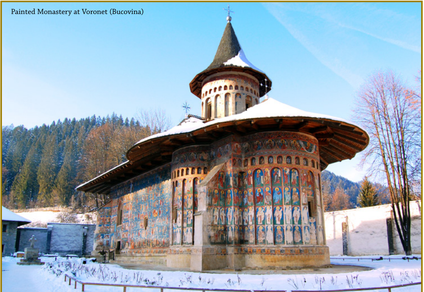
Painted Monastery at Voronet (Bucovina)

The broad Danube River runs through the middle of this stunning metropolis, dividing hilly Buda