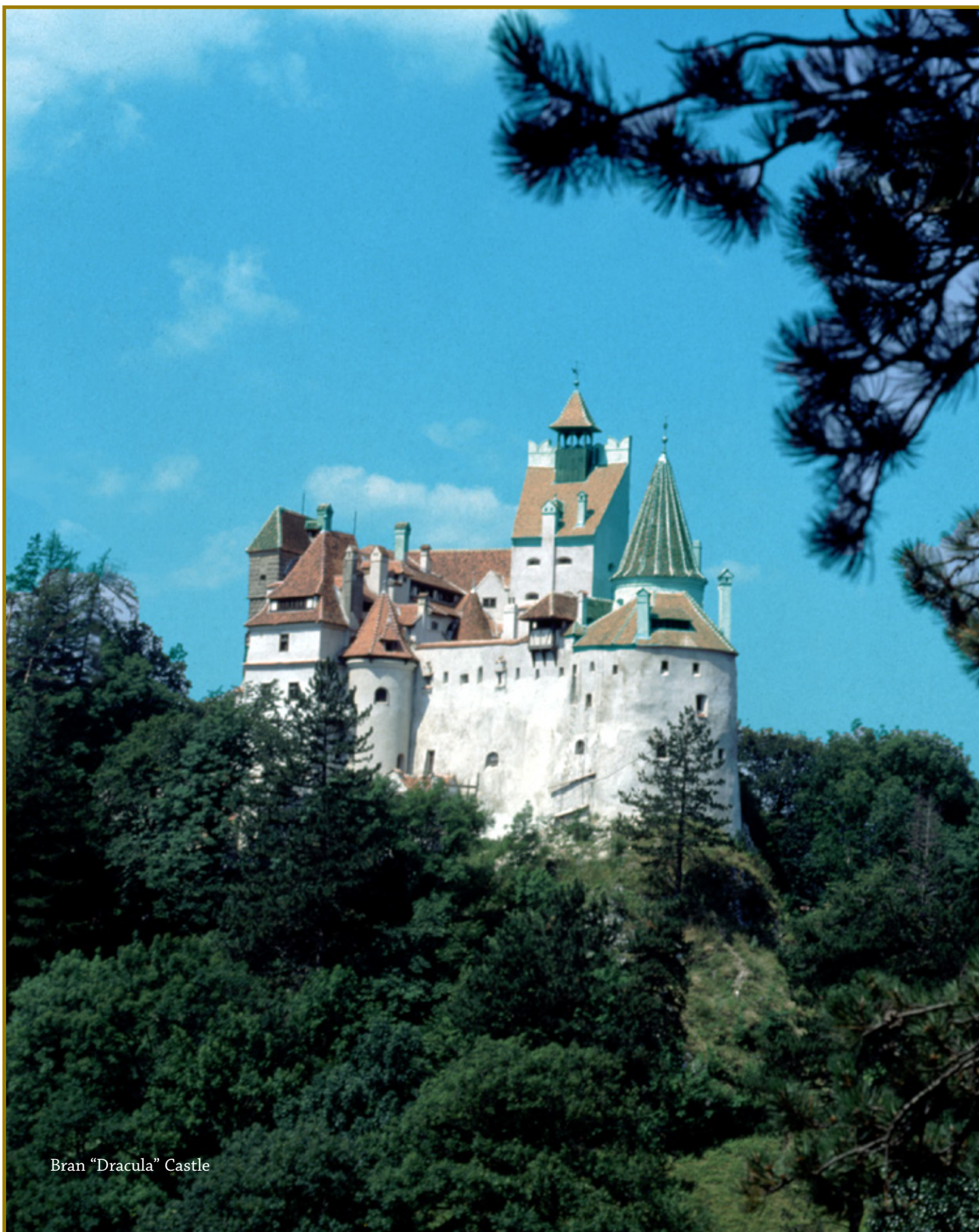
Bran "Dracula" Castle