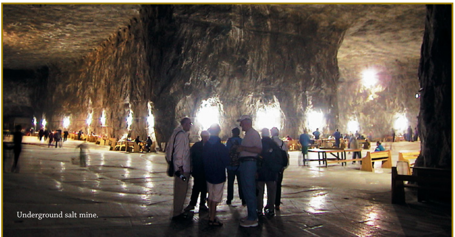
Underground salt mine.

Afterwards we continue with a visit to the Salt Mine at Praid. Traveling by bus, we descend down into the mine far below the surface. Today the salt mine is a sanatorium for children who suffer from asthma. They come here to live and sleep for several weeks while they receive care for their