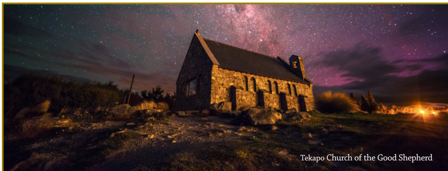
Tekapo Church of the Good Shepherd