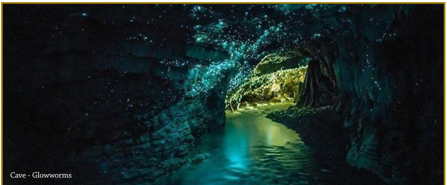
Cave - Glowworms

After breakfast we fly to Christchurch. Often referred to as the Garden City, Christchurch features many majestic trees and extensive parks and gardens, the most notable of which is expansive Hagley Park in the heart of the city. Bordering the park you will find the botanical gardens and the Gothic revival building which houses the Canterbury Museum. The Avon River gently winds its way around these inner city landmarks and out through sprawling suburbs to the Pacific Ocean. We'll begin with a visit to the International Antarctic Center to learn about the amazing feats of the early explorers, what is currently happening now with Antarctic