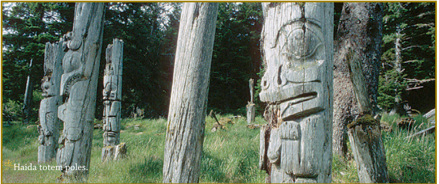
Haida totem poles.