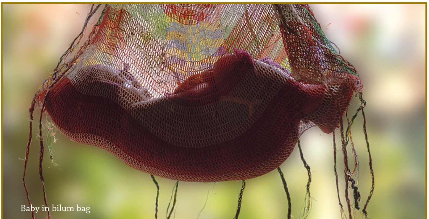
Baby in bilum bag