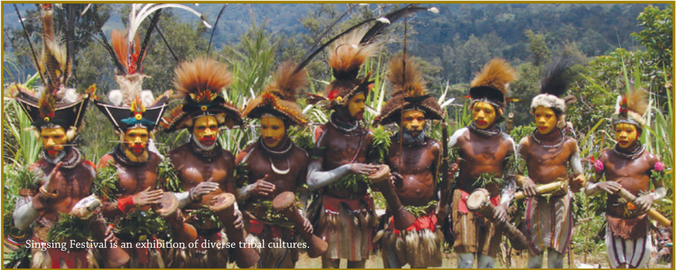
Singing Festival is an exhibition of diverse tribal cultures.