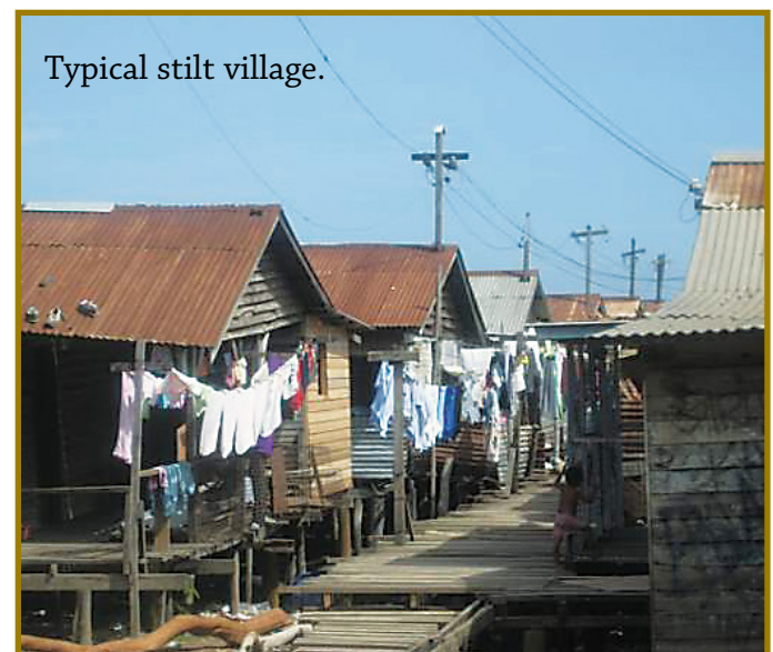
Typical stilt village.