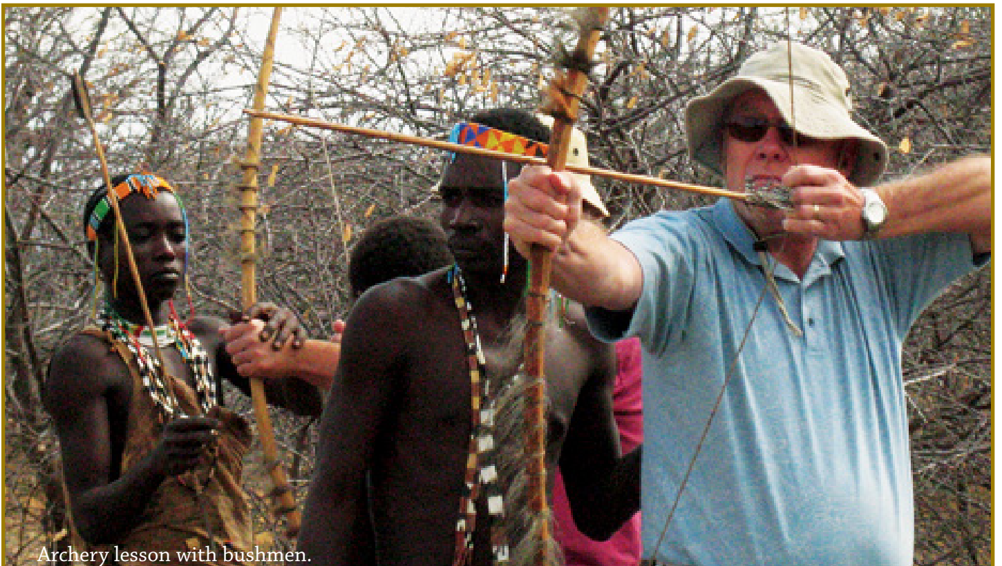
Archery lesson with bushmen.