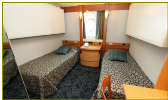
Exterior Twin Cabin aboard the Ocean Endeavour.