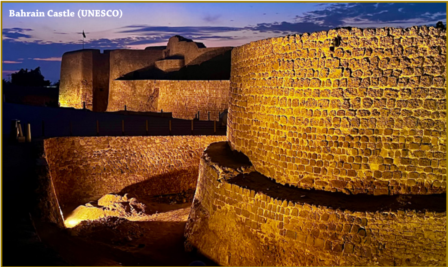
Bahrain Castle (UNESCO)