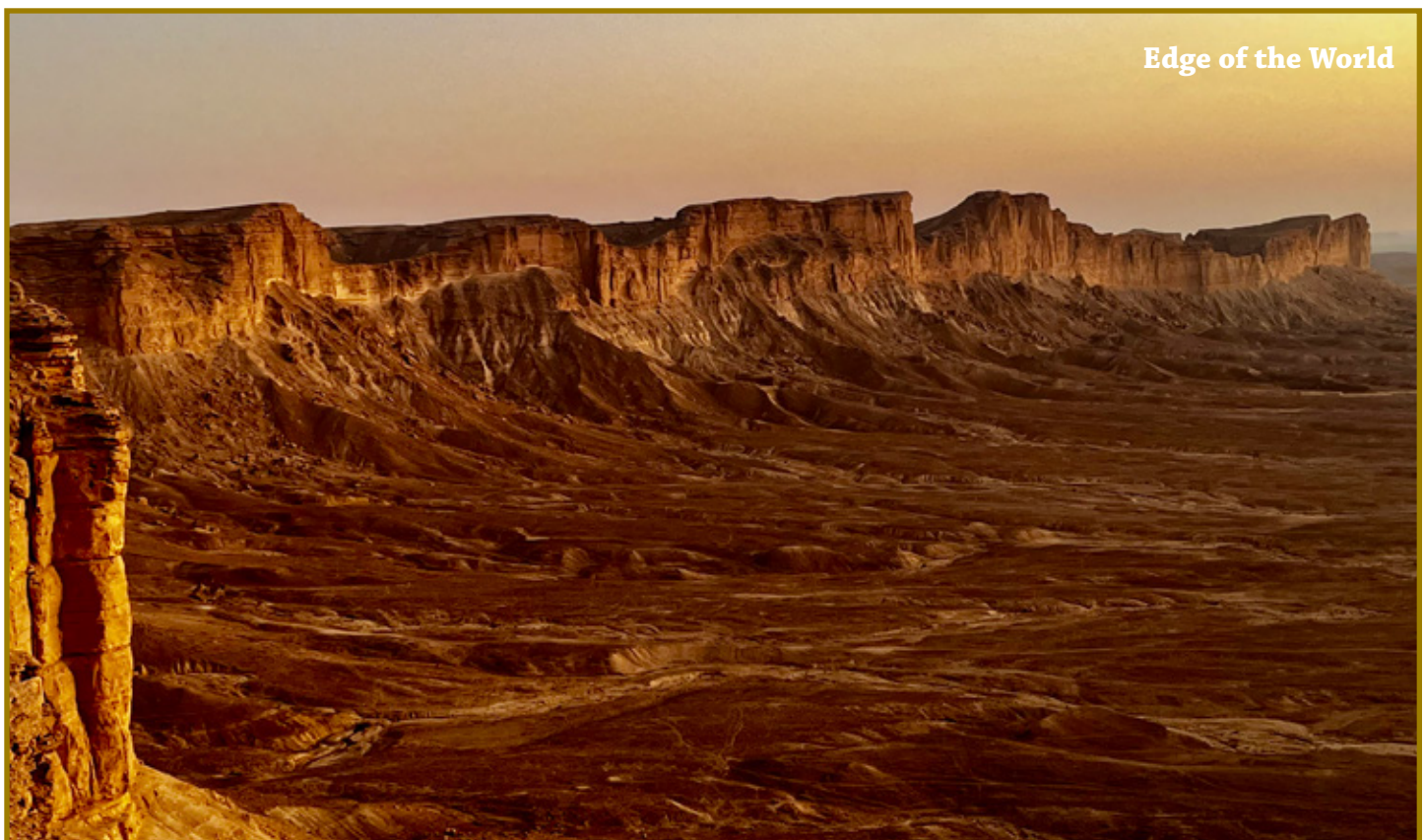
Edge of the World

Afterwards, we will explore Ushaigur Historical Village, one of the most beautiful traditional villages in all of Saudi Arabia. Meander through its alleys and tunnels, discovering different buildings and squares from the ground, rooftops, and even from the tower, which offers spectacular views of the village and surrounding landscape.