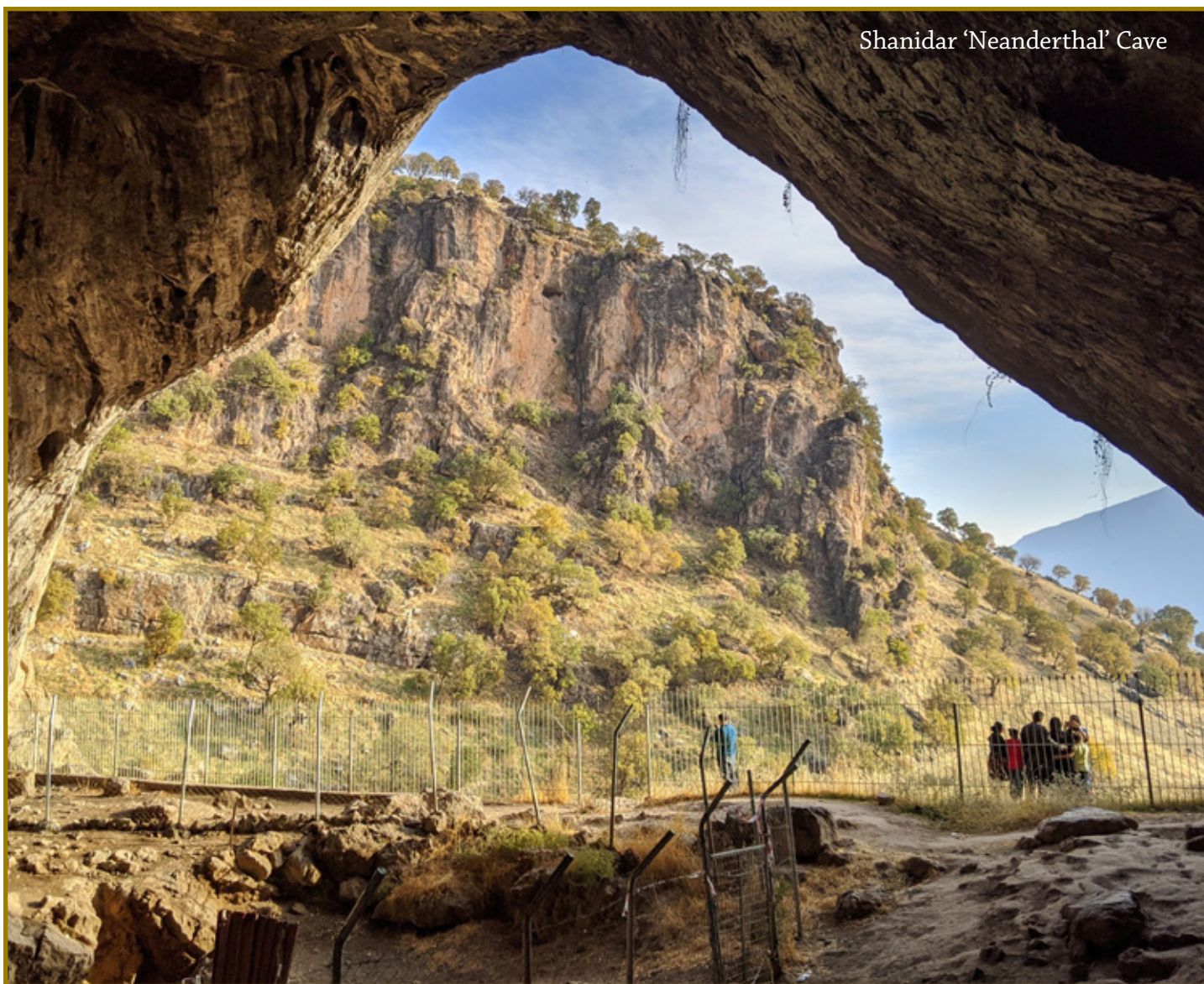
Shanidar 'Neanderthal' Cave

Today you are transferred to the airport for your flight home from Erbil.