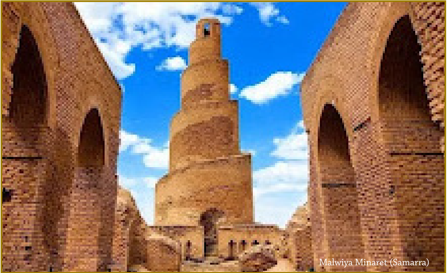
Malwiya Minaret (Samarra)