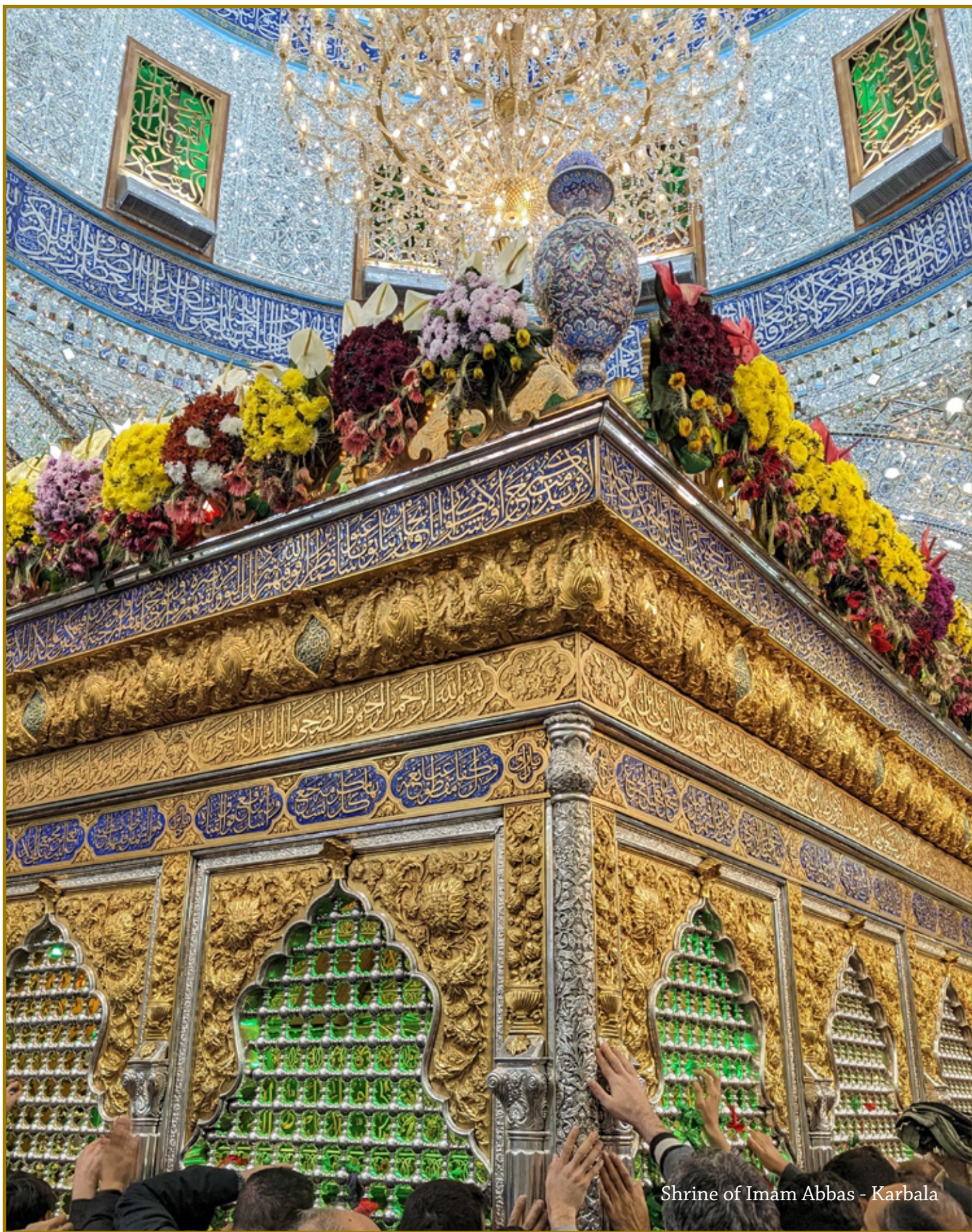
Shrine of Imam Abbas - Karbala