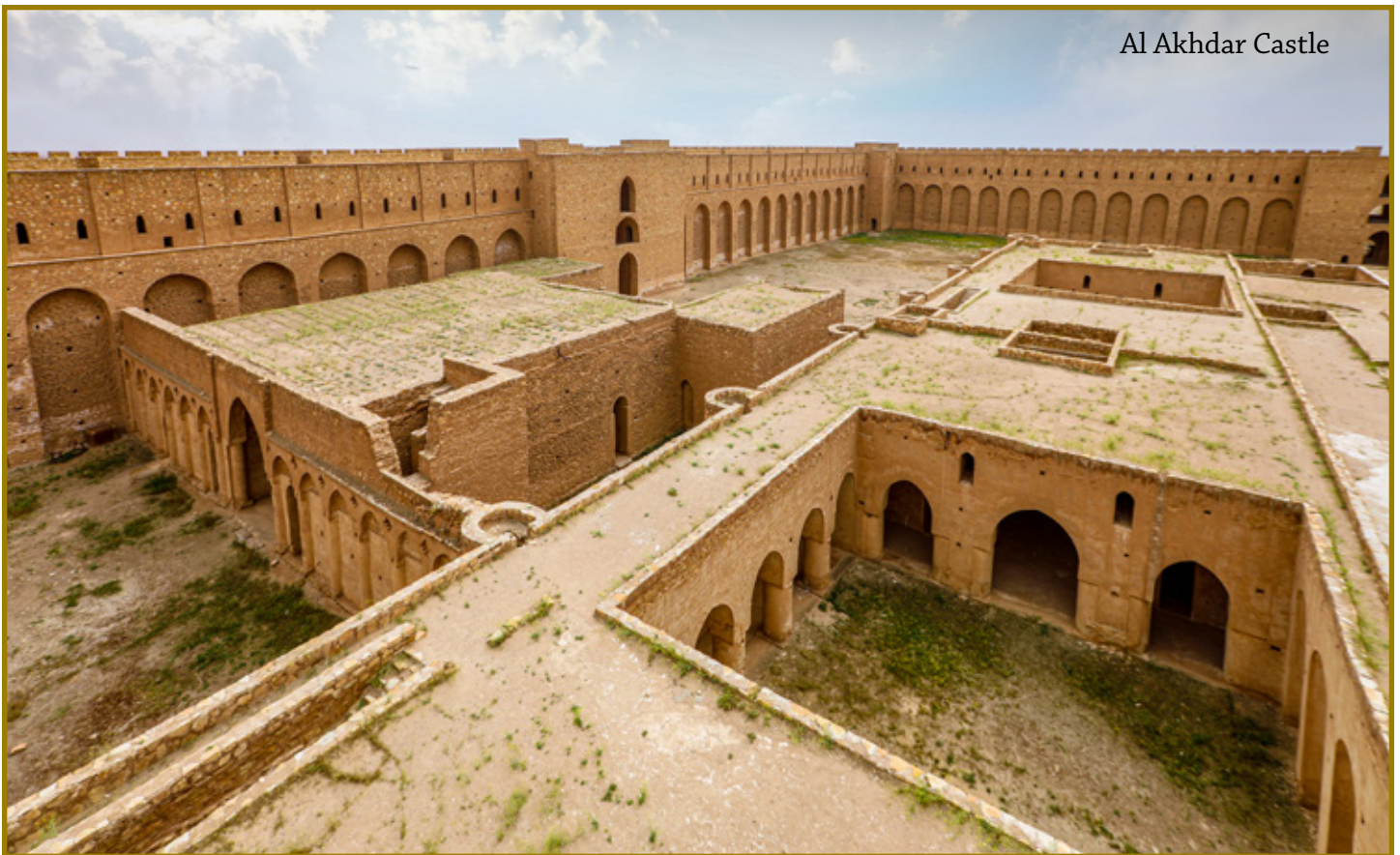
Al Akhdar Castle