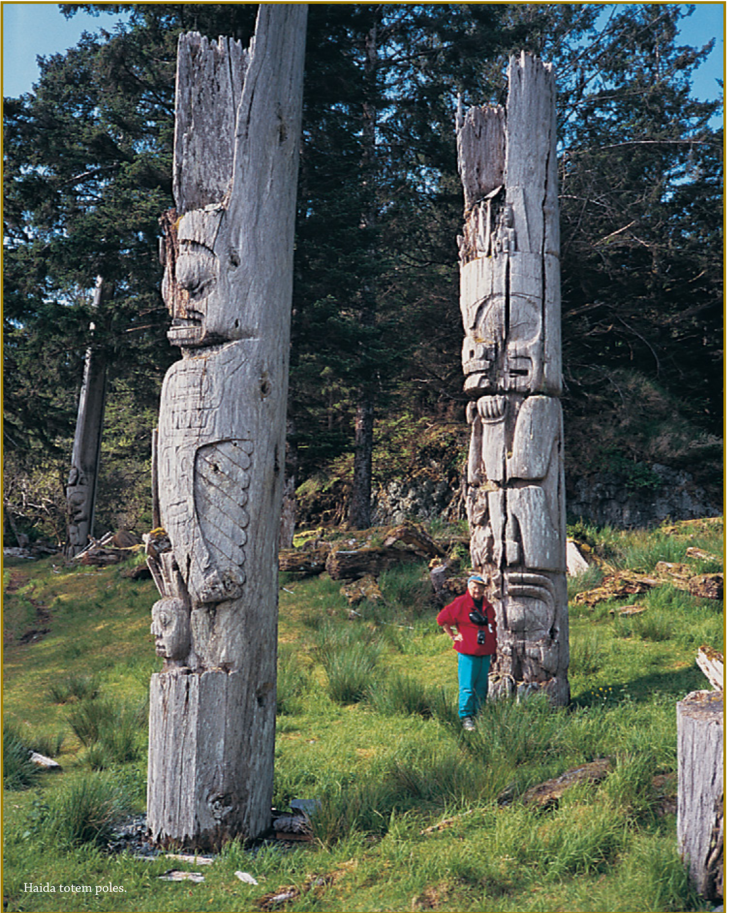
Haida totem poles.