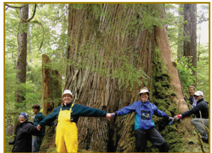
Cathedrals of ancient trees.