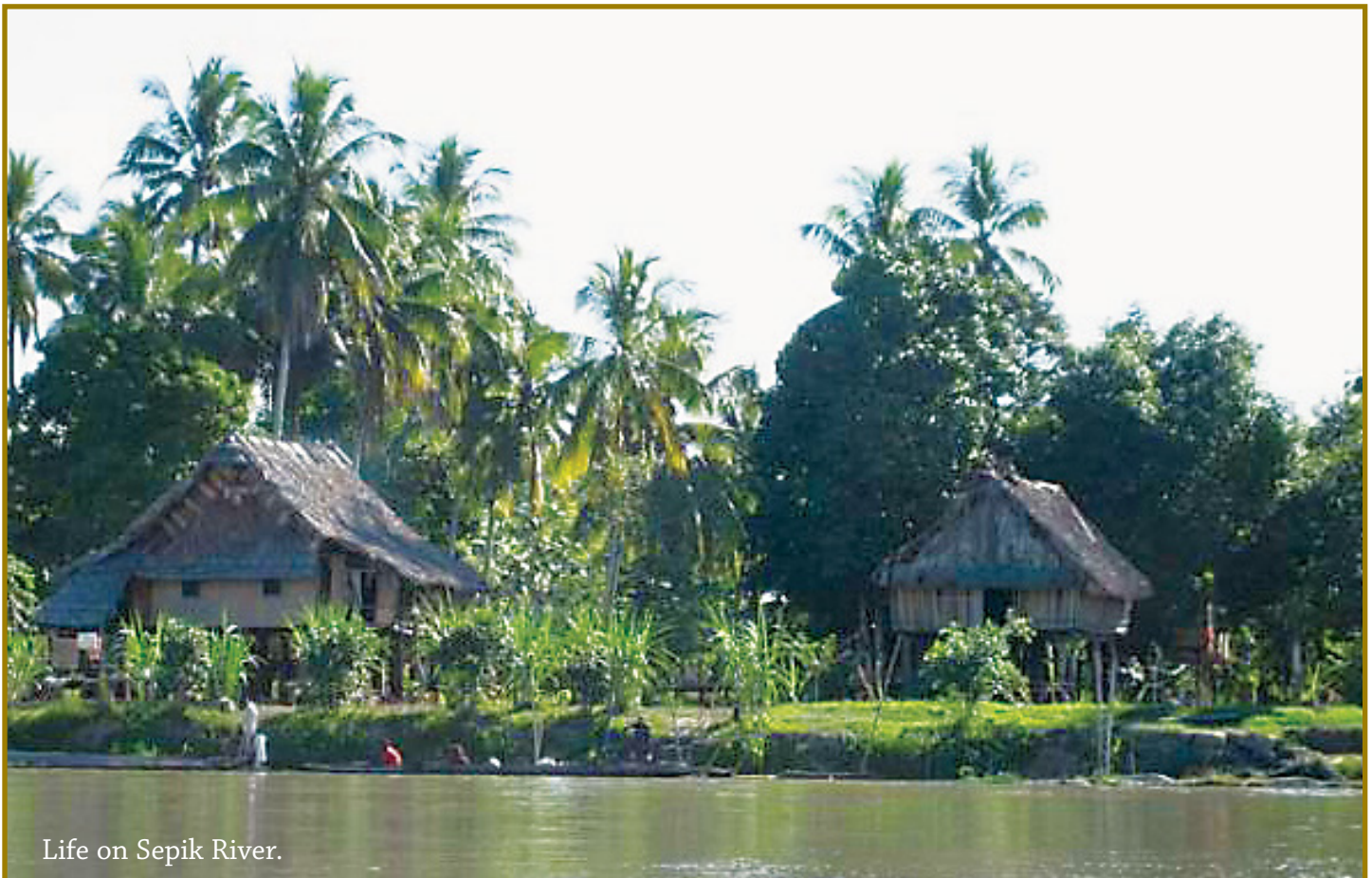
Life on Sepik River.

Today we travel along the shadow of Mt. Hagen, to an area well known for its bird watching. In addition to the birds of paradise (75% of the birds of paradise species can be seen here), you may also spot the crested berrypecker, white winged robin, tit berrypecker, brown sicklebill