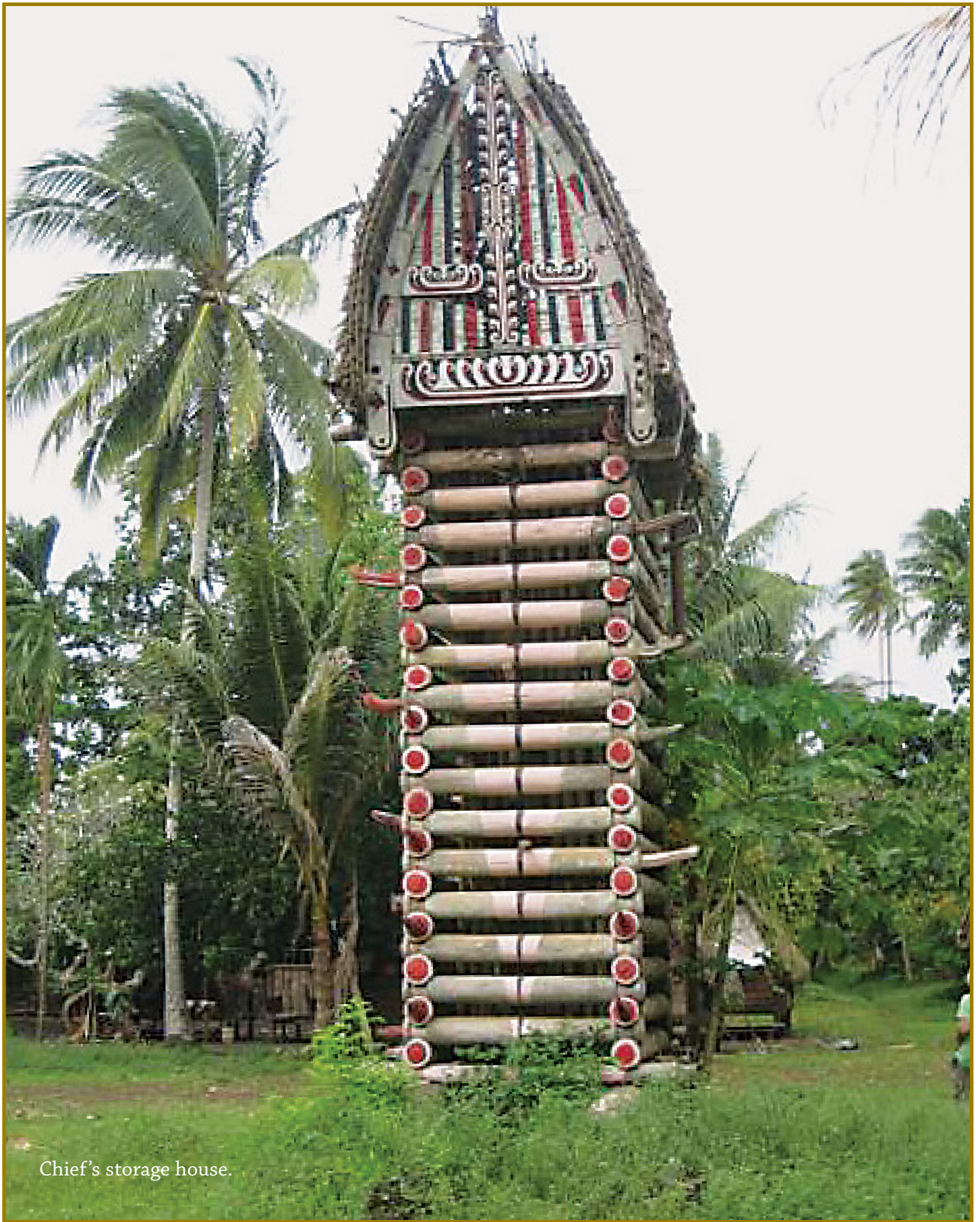
Chief's storage house.