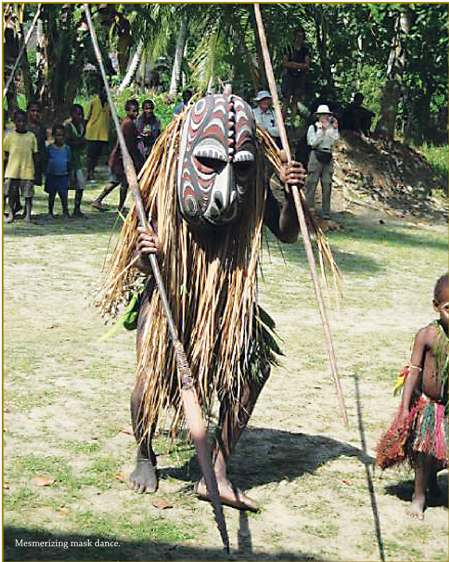
Mesmerizing mask dance.