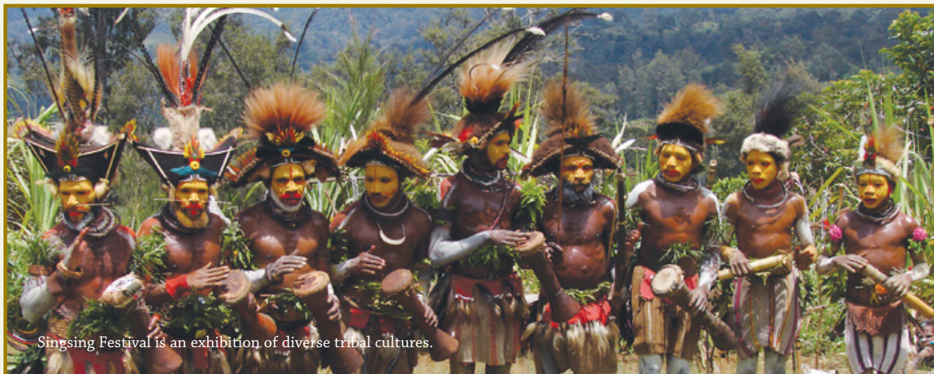
Singing Festival is an exhibition of diverse tribal cultures.