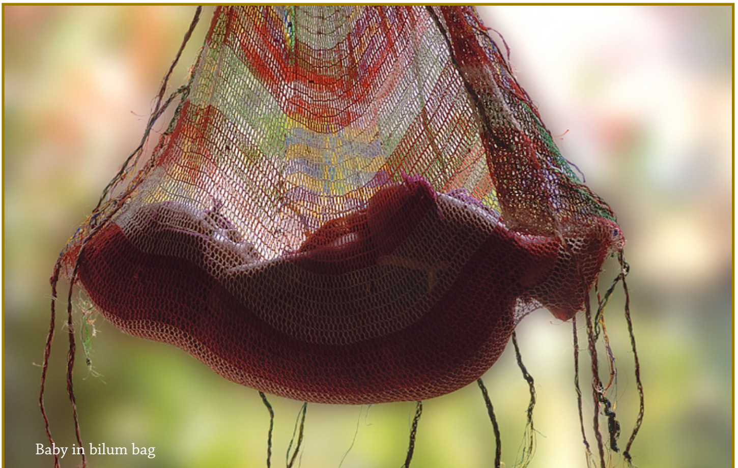
Baby in bilum bag

Today we travel by dugout canoes along the Sepik River and its tributaries. Before heading out, we explore Palimbe