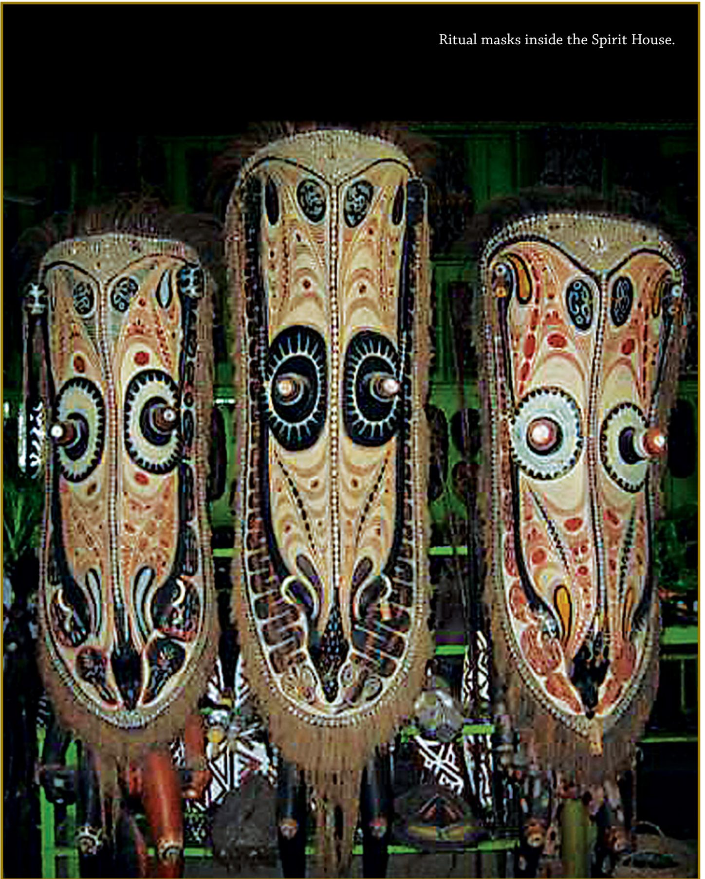
Ritual masks inside the Spirit House.