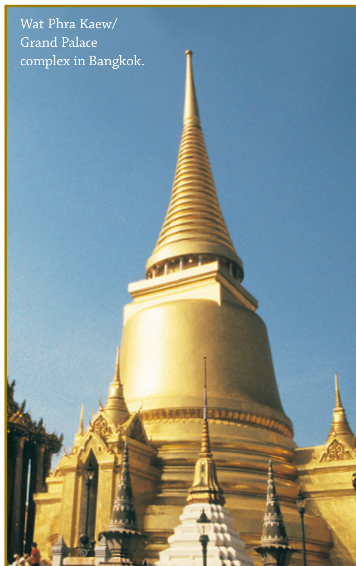
Wat Phra Kaew/ Grand Palace complex in Bangkok.