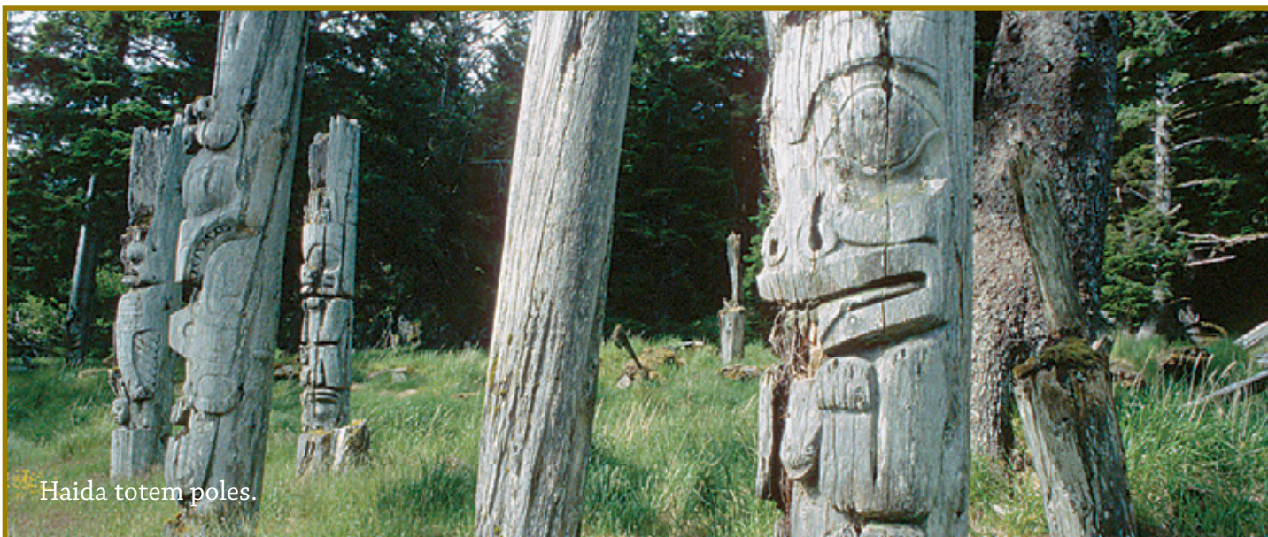
Haida totem poles.