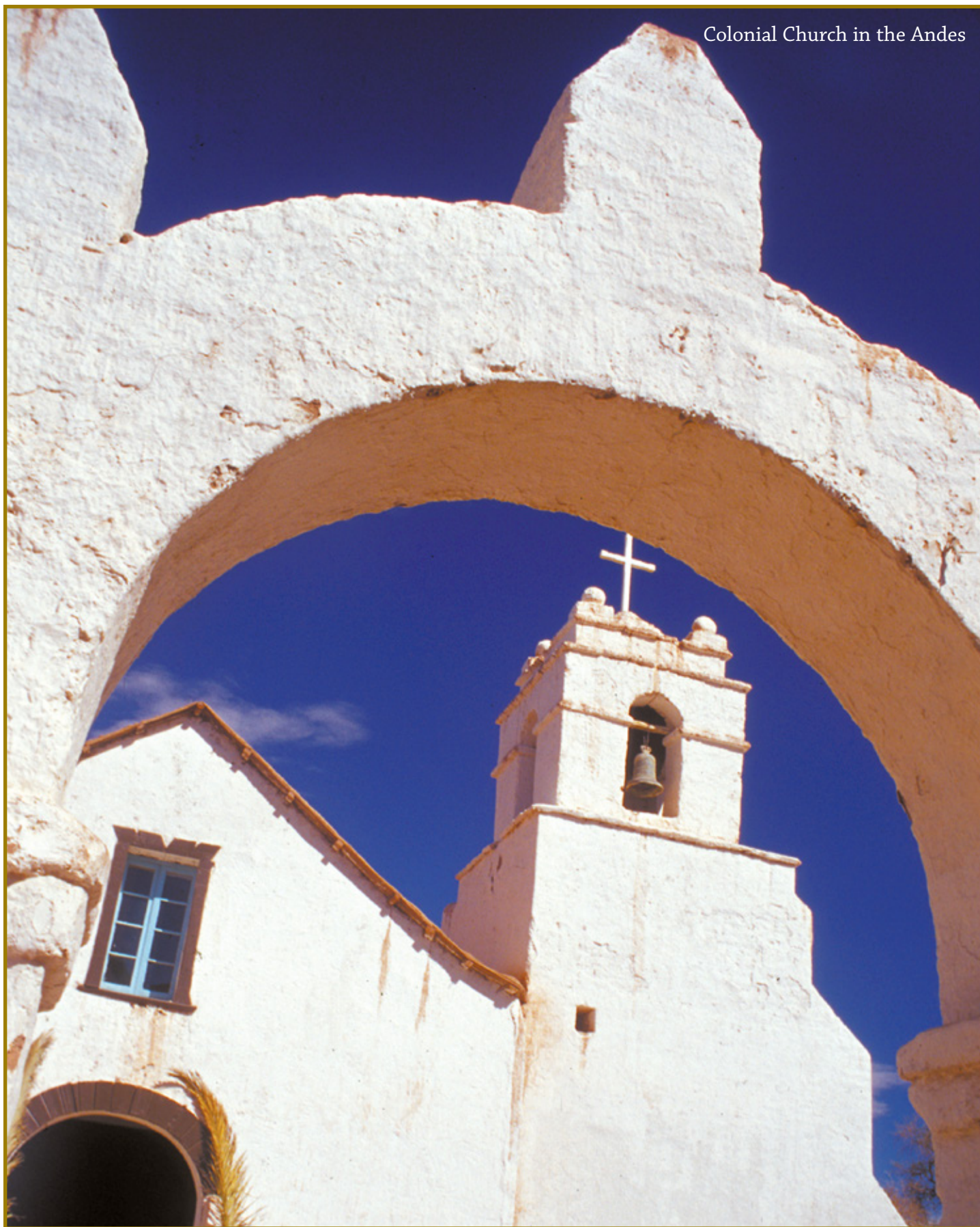
Colonial Church in the Andes