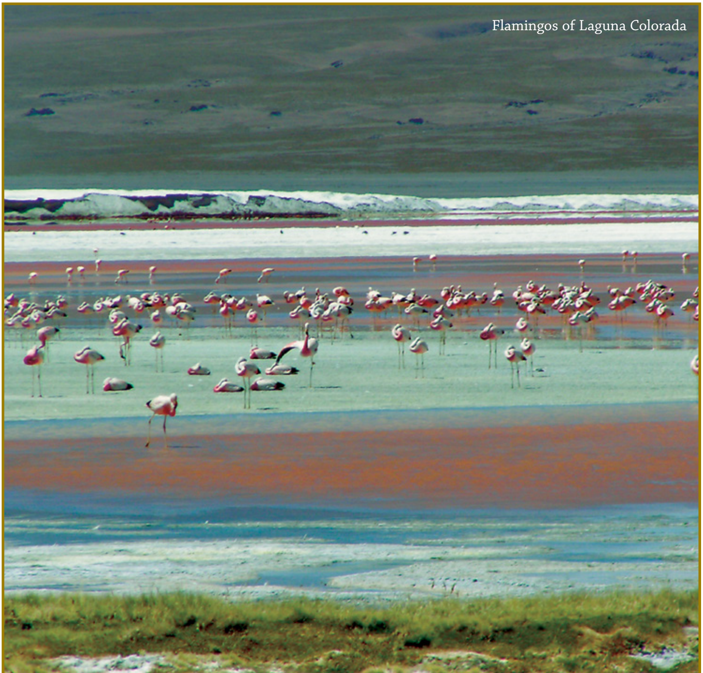
Flamingos of Laguna Colorada

Today we depart for our homeward flights or join our extension to Easter Island. Note: if you wish to sight-see in Santiago, we recommend you stay an additional night.