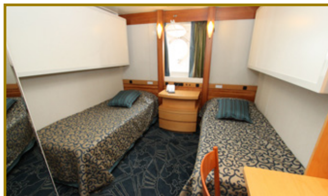
Exterior Twin Cabin aboard the Ocean Endeavour.