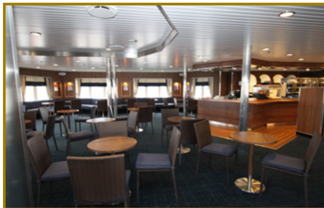
Aurora Lounge aboard the Ocean Endeavour.

Outfitted with twenty Zodiacs, advanced navigation equipment, multiple lounges and a top deck observation room, the Ocean Endeavour is purpose-built for passenger experiences in remote environments. The Ocean Endeavour boasts a 1B ice class, enabling her to freely explore throughout the Arctic summer. Launched in 1982, she has had numerous upgrades, most recently in 2010 and 2014.