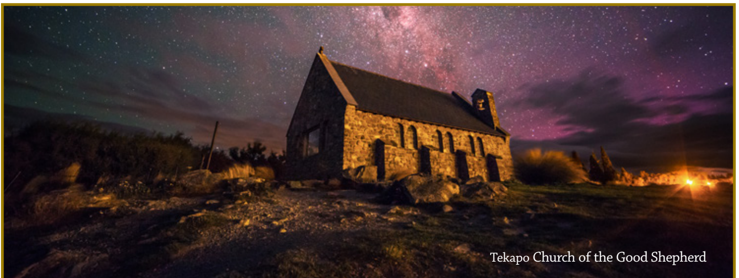
Tekapo Church of the Good Shepherd

This evening you can soak, relax and take in the view of the snow capped mountains and forests of the Southern Alps in the thermal pools. There are nine open-air thermal pools, three sulphur pools and four private thermal pools, as well as a sauna/steam room. The mineral spas are great for soaking after a day of walk-