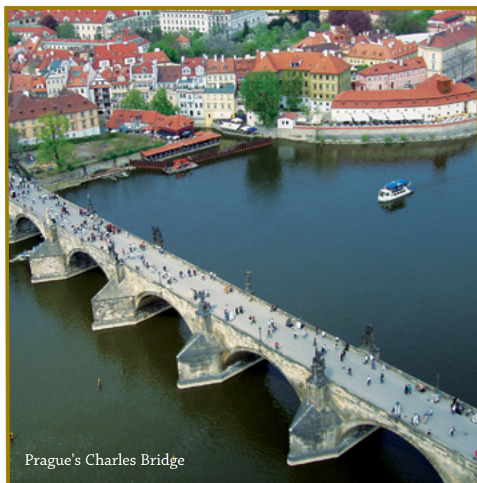
Prague's Charles Bridge