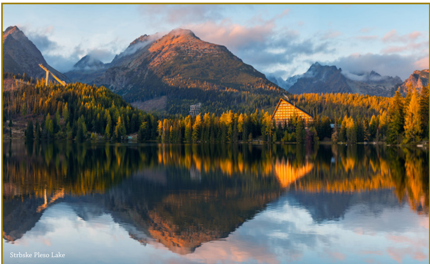
Strbske Pleso Lake