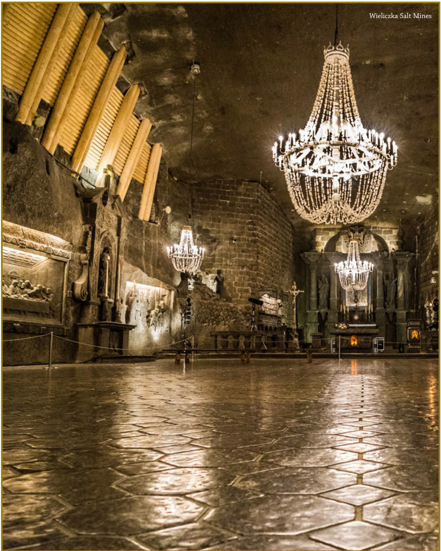
Wieliczka Salt Mines