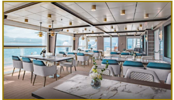
Panorama Restaurant aboard the Ocean Victory.