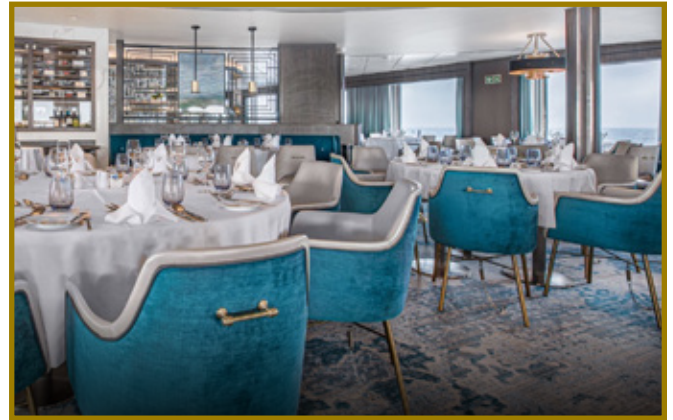
Beagle Restaurant aboard the Ocean Victory.

Life aboard the Ocean Victory feels like stepping into a welcoming community at sea. Panoramic decks, bright lecture lounges, a cozy library, and excellent outdoor spaces provide natural gathering places—perfect for sharing discoveries, swapping stories, or reflection. Guests also enjoy hands-on workshops that spark creativity and learning. Accommodation includes ninety-three ocean-view cabins, most with private balconies, plus single-occupancy options for independent travellers. Wi-Fi (basic service included) ensures guests stay connected while immersed in the adventure.