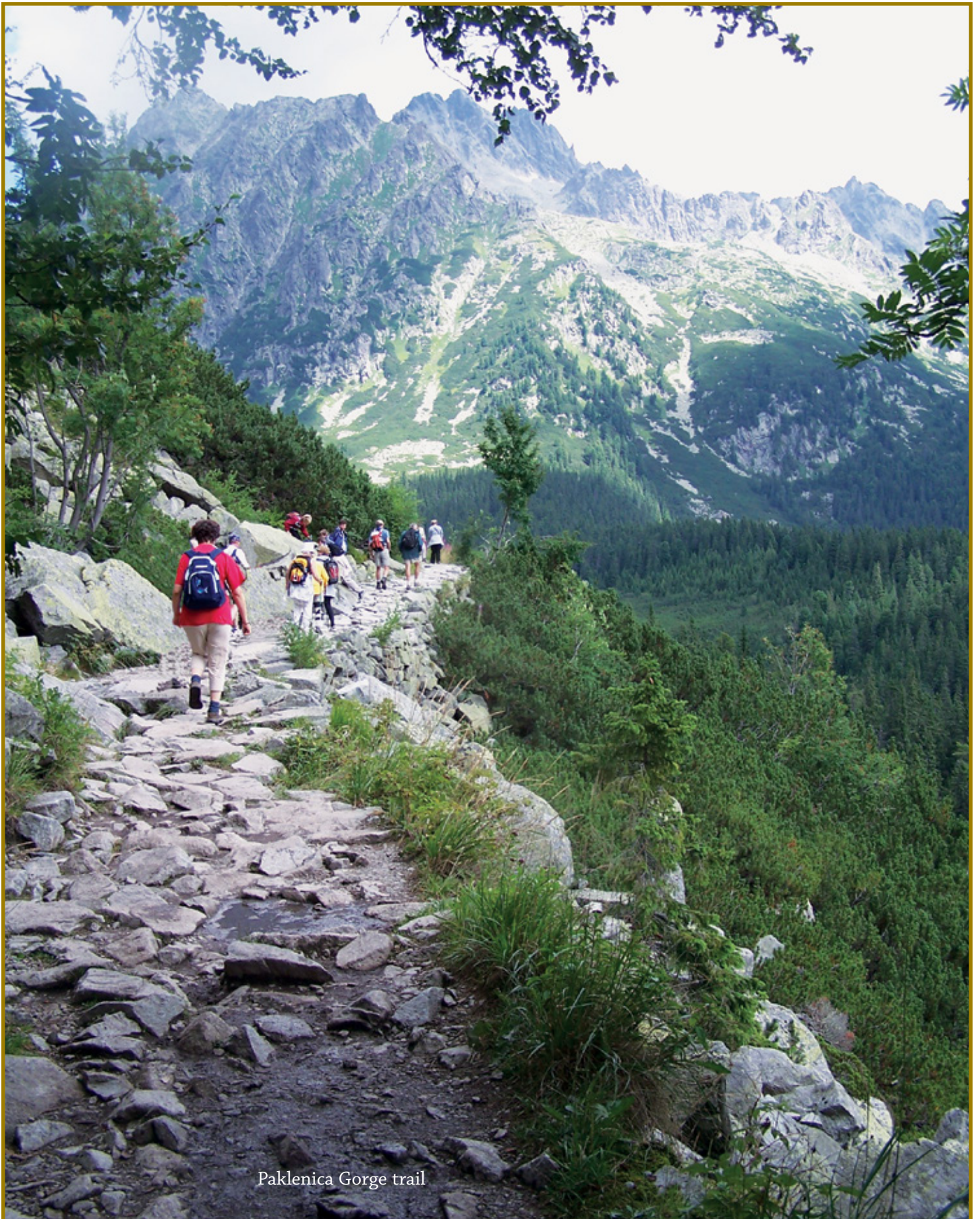
Paklenica Gorge trail