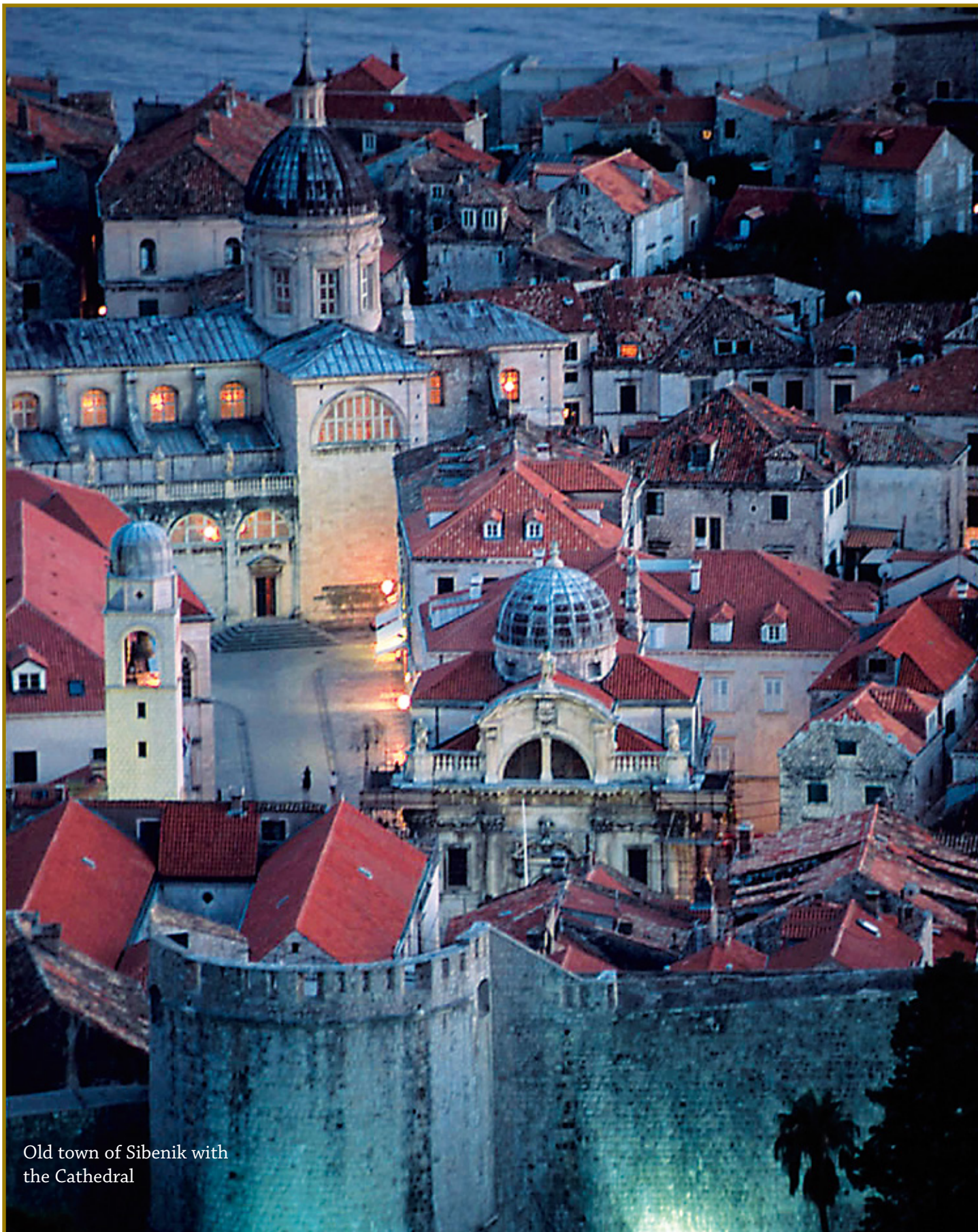
Old town of Sibenik with the Cathedral