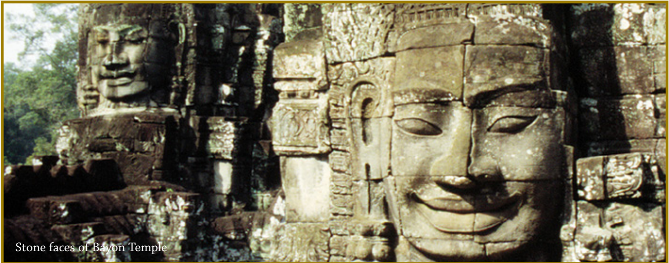
Stone faces of Bayon Temple

Leave the outside world behind...travel through the world of Hindu mythology and arrive at the doorstep of the gods. Angkor Wat is the largest religious monument ever built, covering an area of 200 acres with its towers, terraces and causeways. The Khmer Empire reached its zenith of artistic expression and architecture with the building of Angkor Wat.