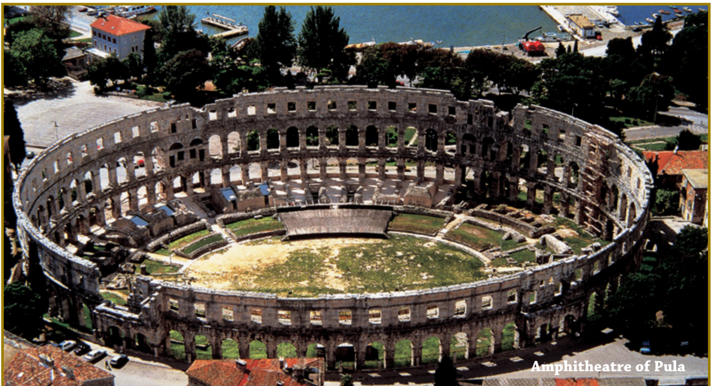
Amphitheatre of Pula