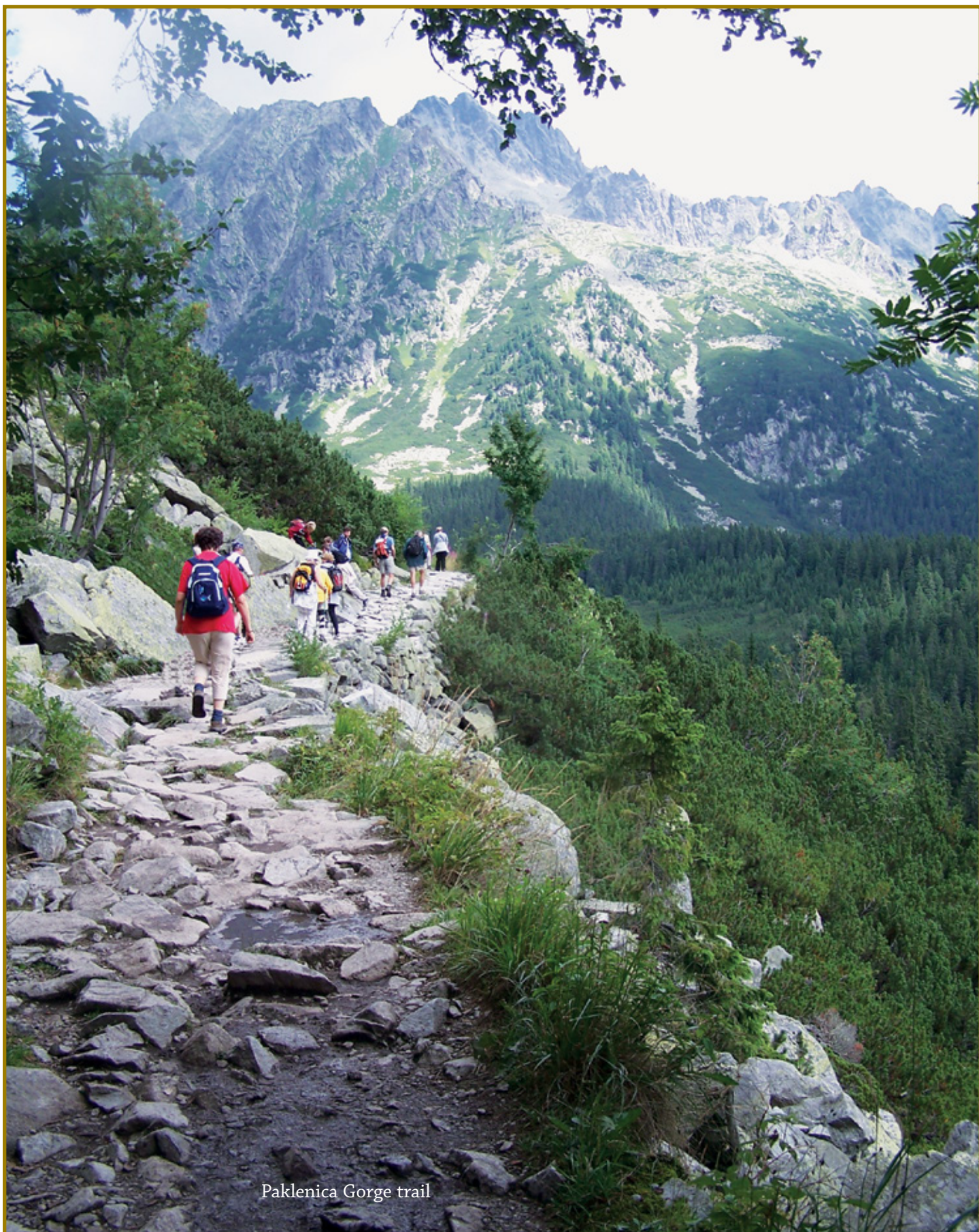
Paklenica Gorge trail