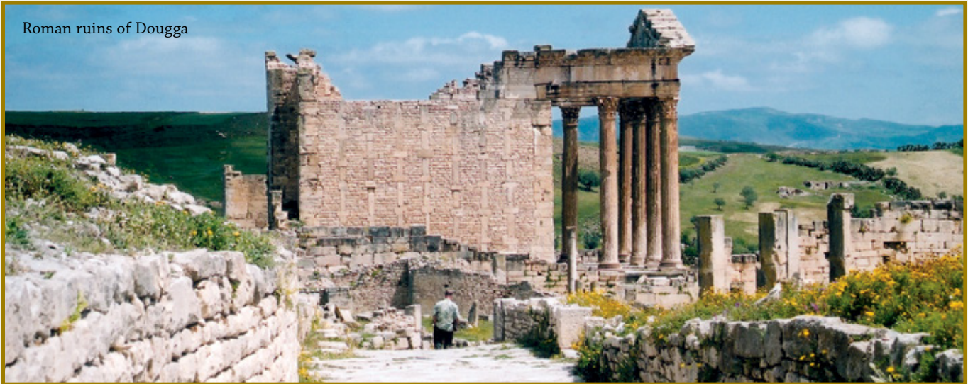
Roman ruins of Dougga

Wind-swept landscapes, coastal beaches, immense Roman ruins and desert oases are nestled amongst the vast dunes of the Sahara, making Tunisia and Algeria perfect adventure destinations that offers something magical for every traveler.