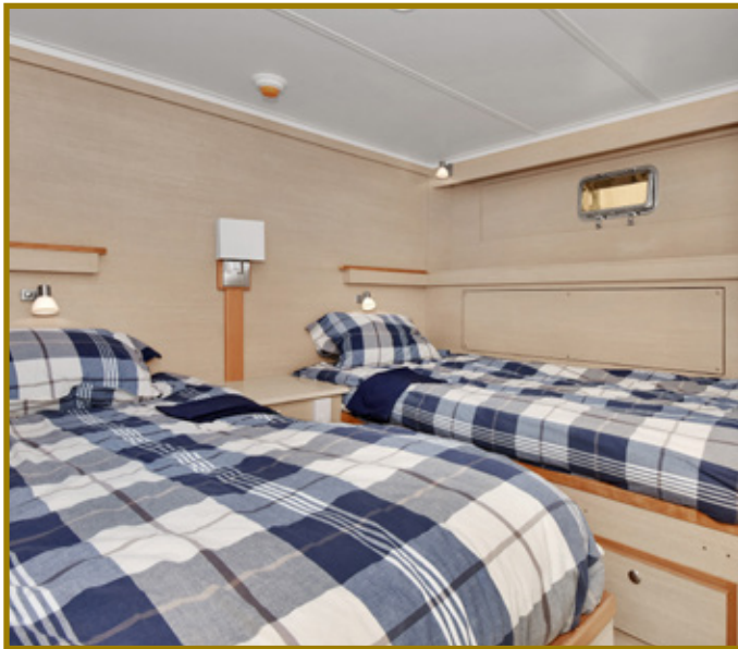
The Island Solitude

Please use this itinerary as a guide only. The sailing itinerary may be done in a different order.