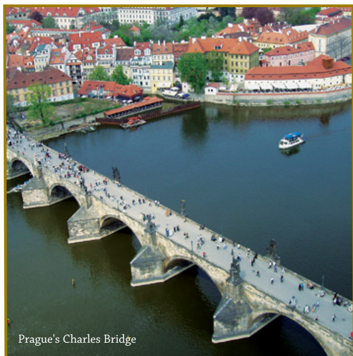
Prague's Charles Bridge