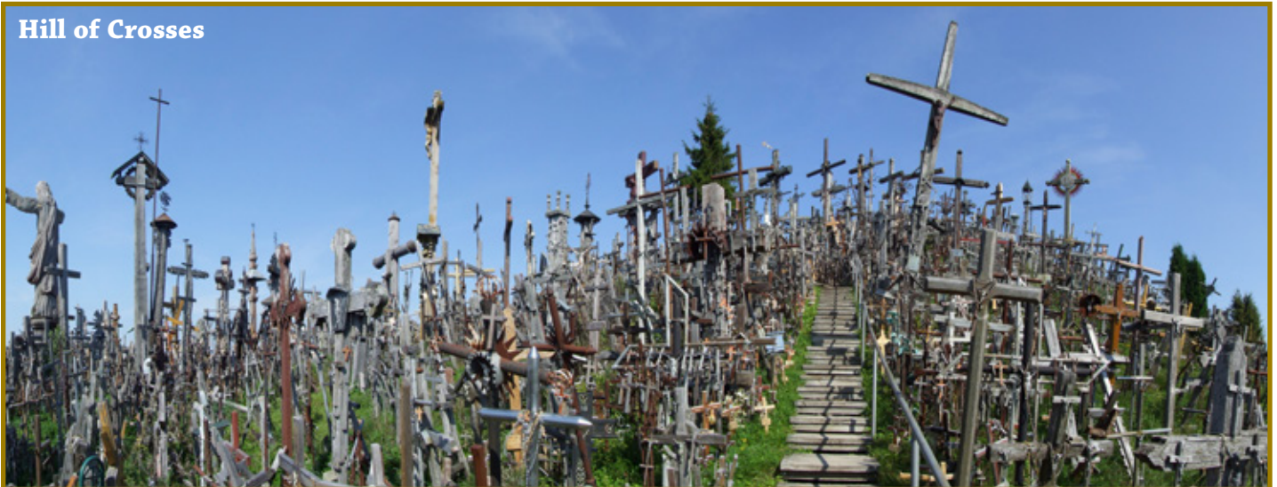
Hill of Crosses

Today we travel to Gauja National Park and to one of the most picturesque towns in Latvia, Sigulda. Gauja National Park is known as the most popular tourist and leisure destination in Latvia, known primarily as a winter sport resort because of its bobsleigh track