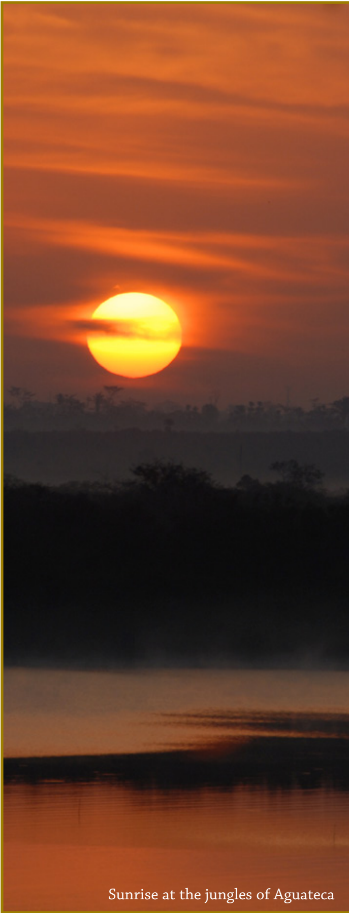
Sunrise at the jungles of Aguateca