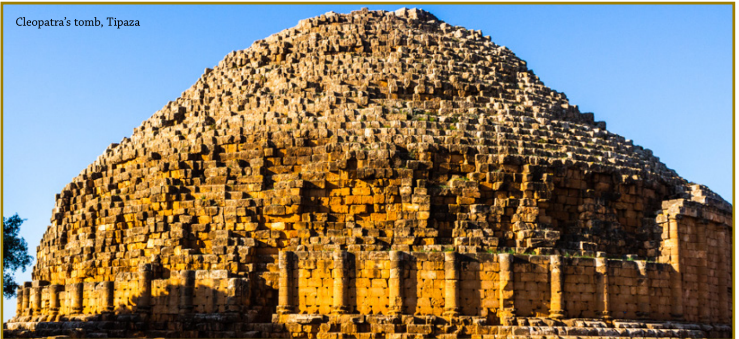
Cleopatra's tomb, Tipaza