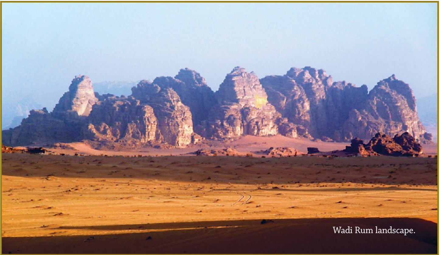
Wadi Rum landscape.

Opportunities for climbing and trekking abound in the area and the flora and fauna is exquisite and numerous.