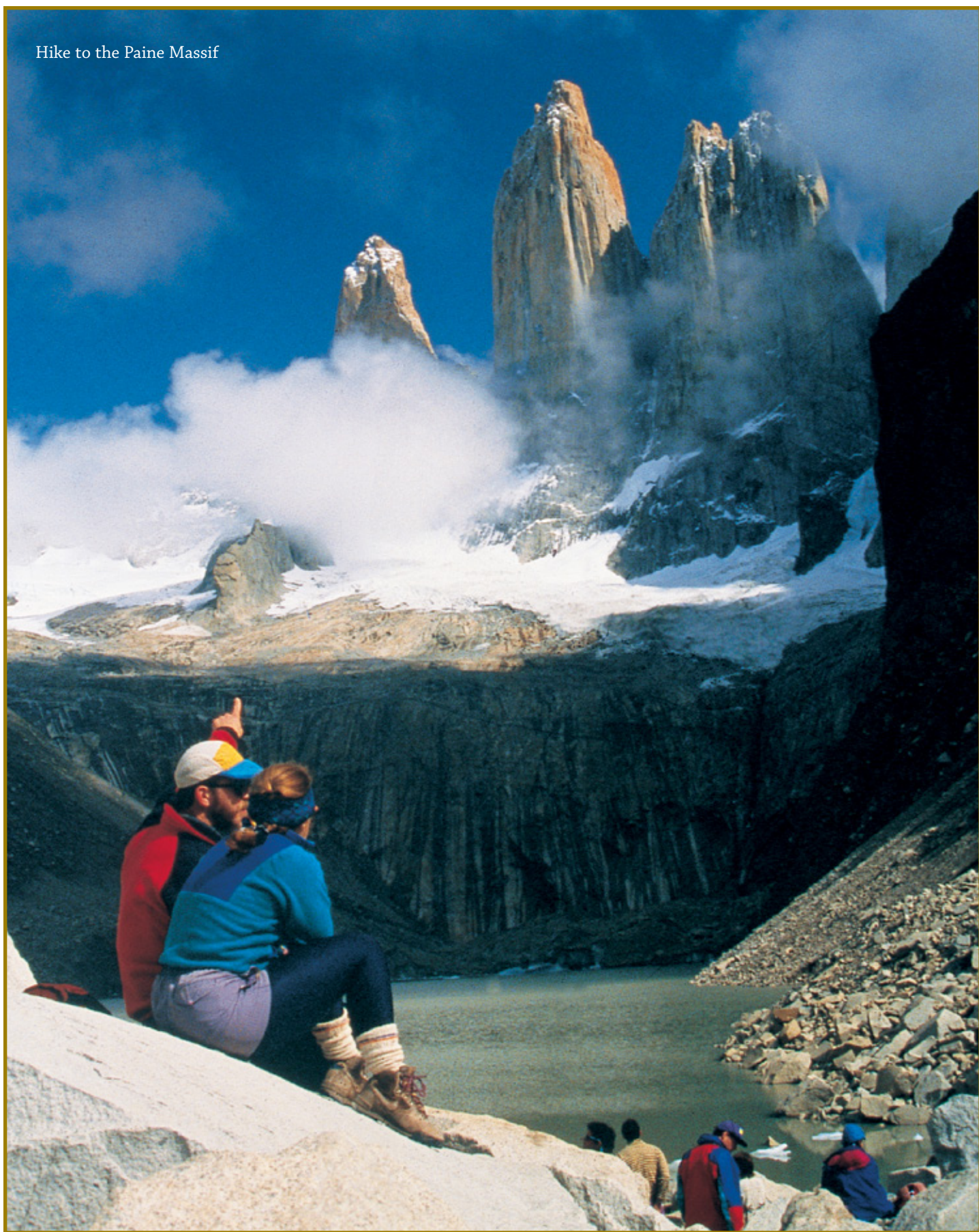
Hike to the Paine Massif