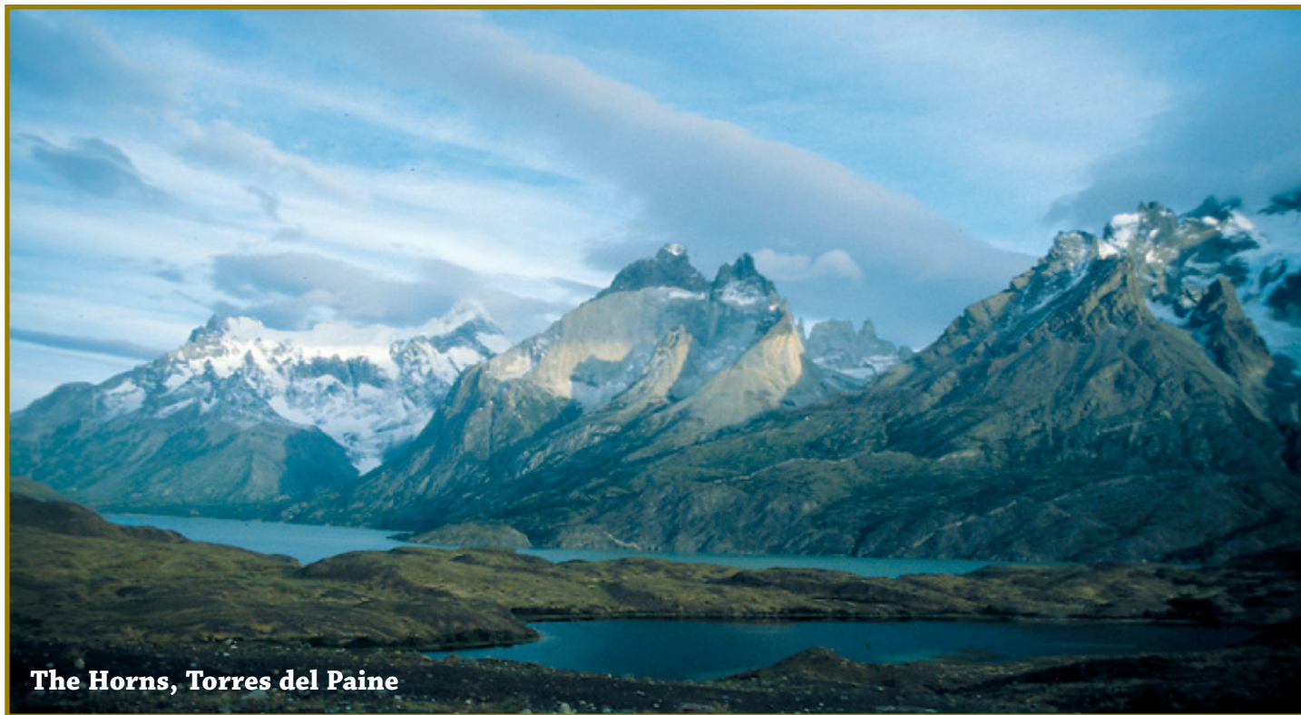
The Horns, Torres del Paine