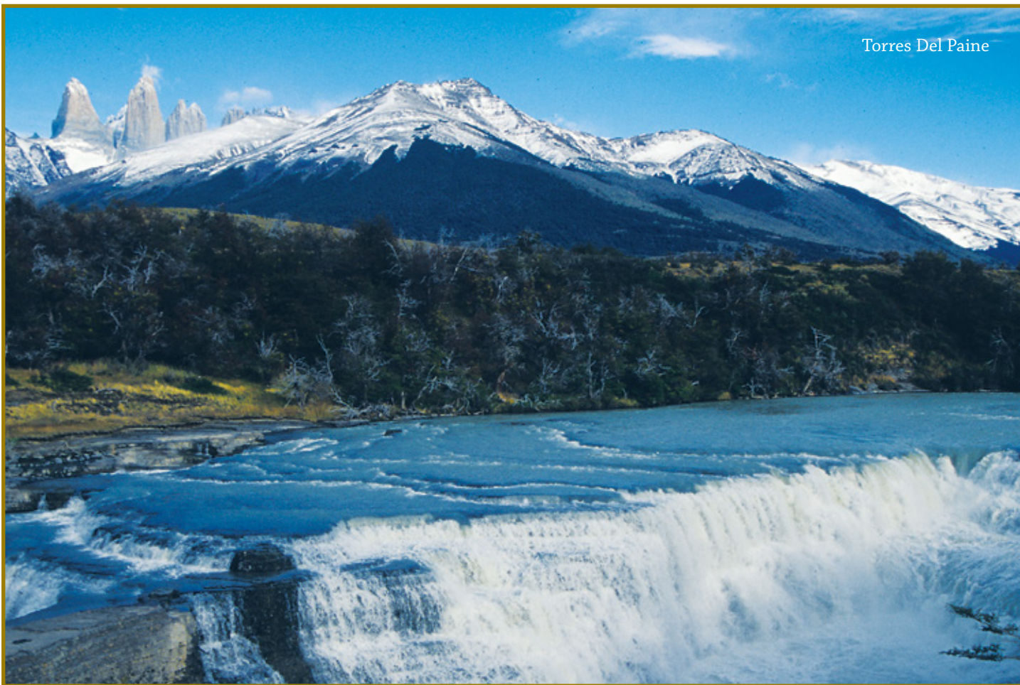
Torres Del Paine