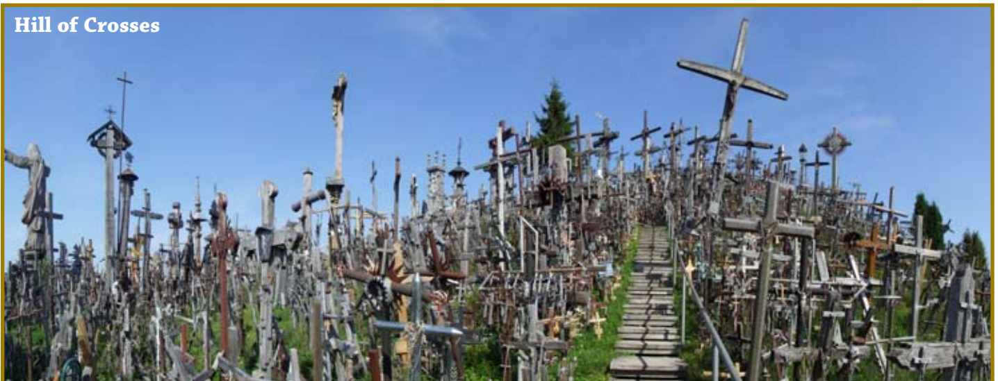
Hill of Crosses

Today we travel to Gauja National Park and to one of the most picturesque towns in Latvia, Sigulda. Gauja National Park is known as the most popular tourist and leisure destination in Latvia, known primarily