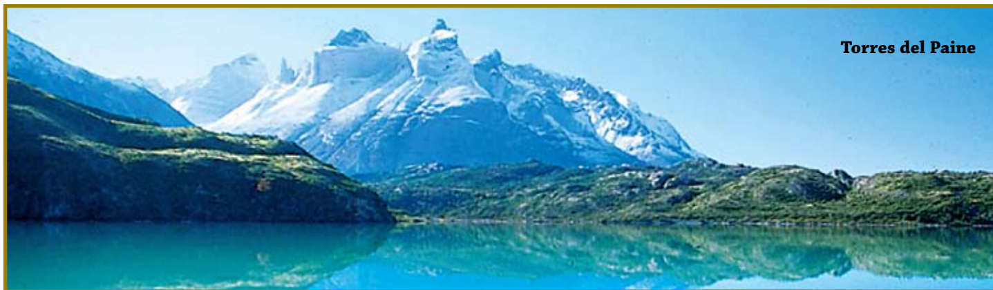
Torres del Paine