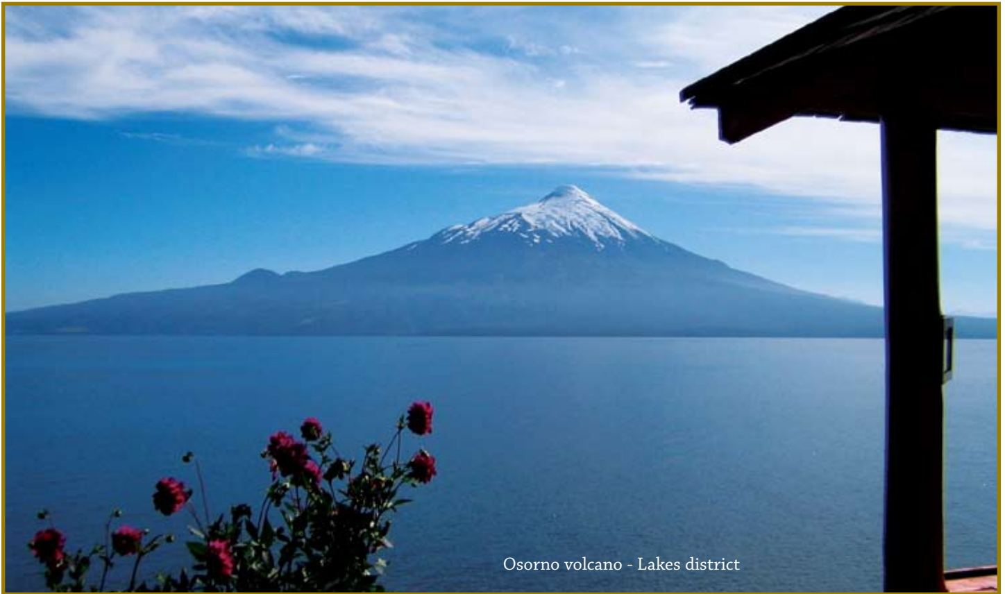
Osorno volcano - Lakes district

After lunch we drive to the Petrohué rapids in the Petrohué River that drains the All Saints Lake. We will have time for one or two short strolls and enjoy unbelievable views of the rapids with the Osorno in the back and the forested mountains around. After our visit, we will drive back to Puerto Varas. Time permitting, you may be able to visit the town on your own.